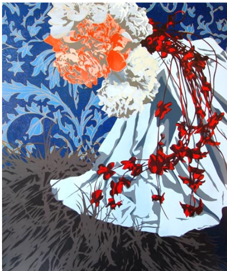
Robert Mellor, Lithe , 2007. Acrylic on canvas on panel. 48 x 40 in.

The word "scenario" originally referred to the instructions on the back of painted theater scenery used as directions for actors entering a "scene." Robert Mellor's New Scenarios can be viewed as new propositions for visual enactment by the viewer, each work providing cues for engaging with the composition, layer by layer, edge by edge, line by line, color by color. While it can be said that any work of art comes alive as art by a viewer's active engagement, Mellor foregrounds this relationship by composing works of arresting beauty that compel viewers to re-enact the process of composition with the artist.